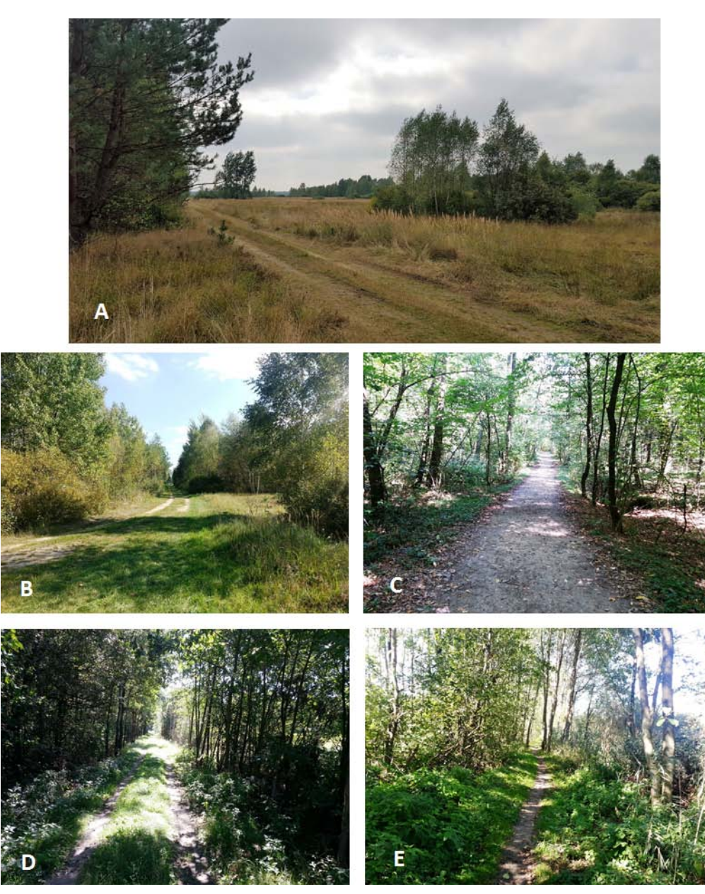
Figure 2. Ecologically different habitats of Dermacentor reticulatus located in the Polesie National Park: A- locality 1; B – locality 2; C – locality 3; D – locality 4; E – locality 5.

previous studies [13]. Ticks were usually collected only on clear days without precipitation and with moderate or no wind.